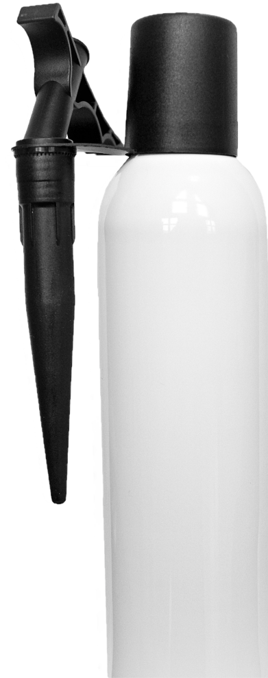
Brush Adapter on Can