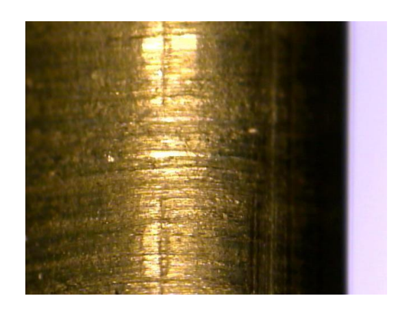
Figure 5: Bead of an Aluminum can magnified 88X showing eyelashing

5. Stainless Steel (see Figure 6): Stainless steel cans are not common due to their high cost. I have only seen them used for a returnable whipped cream product where the valves were removed, the cans cleaned, sanitized and then refilled.