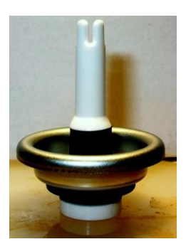
Figure 14: Toggle Valve

2. Toggle Valve: Lets define a toggle valve as a valve that uses rubber to return the valve to the closed position (see Figure 14).