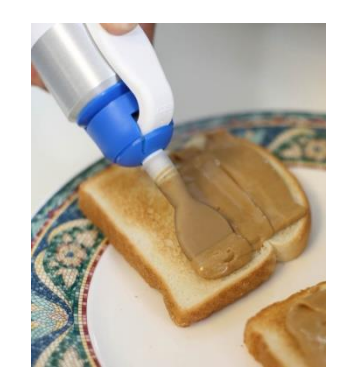
Figure 18: Spreader Tip on Clayton Corporation's EZD System™

4. Decorative: Decorative tips add decorative effects to the product as it is dispensed. They can come as part of the valve, such as the toggle valves shown in Figures 14 & 15 above, be part of the actuator or be threaded or snapped onto the valve. Figure 19 shows Clayton Corporation's cluster of decorative tips supplied with decorating icing.