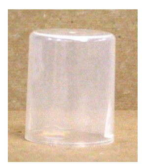
Figure 21: Clayton Corporation's SW158 Overcap

b. Push Button: These overcaps have a button or lever that is pushed to help in removal (see Figure 22)