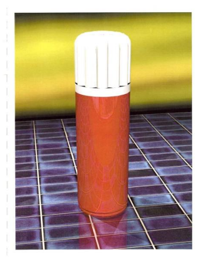
Figure 11 - Necked-In 3-Piece Steel can with Cover

If the overcap is to mount flush with the sidewall of the can then use either a Necked-In 3-Piece Steel Can (see Figure 11) or aluminum can. The aluminum can may be designed to allow attachment of the cover at the intersection of the sidewall and dome providing the inline look or the use of a double shell cover where the inner shell attaches to the valve and the outer shell has the same diameter as the can may be used.