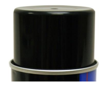
Figure 26: Full overcap that attaches to valve and fits inside the chime

3. Double Shell Overcap: These overcaps snap onto the valve with an inner shell and the overcap's outer diameter fits between the chime and dome. They can be tamper evident/resistant (see Figure 26).