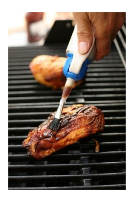
Figure 20: Brush Tip on Clayton Corporation's EZD System™

5. Brush: A brush tip can be used to brush on a product as it is dispensed (see Figure 20).