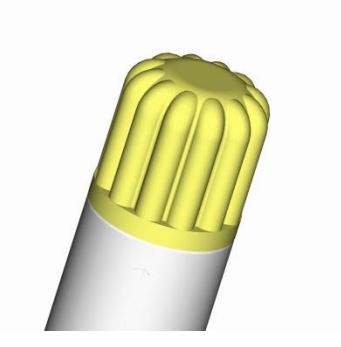
Figure 25: Example of a 3-Piece Necked-In steel Can with Overcap

3. Double Shell Overcap: These overcaps snap onto the valve with an inner shell and the overcap's outer diameter fits between the chime and dome. They can be tamper evident/resistant (see Figure 26).