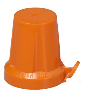
Figure 22: Clayton Corporation's SL508 Overcap

b. Push Button: These overcaps have a button or lever that is pushed to help in removal (see Figure 22)